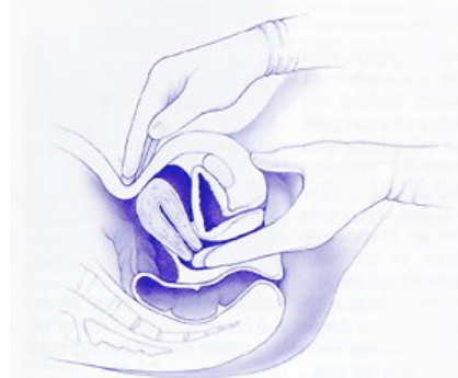
A pelvic exam checks for anything abnormal in your reproductive organs. The exam may detect a cyst.

Ovarian Cysts. Sometimes a cyst may form on an ovary. A cyst is a sac filled with fluid. It is somewhat like a blister. Some cysts on the ovaries form as a result of the normal process of ovulation (release of an egg from the ovary). Often a cyst begins fairly quickly but goes away within a day or two. Some cysts can last a long time. These cysts are often felt as a dull ache or heaviness. Sometimes they cause pain during sex. Sharp pain can occur if a cyst leaks fluid or bleeds a little. This may happen around the middle of the menstrual cycle.