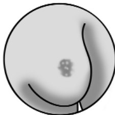
Change in how the nipple looks, like pulling in of the nipple.