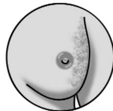
Change in skin color or texture