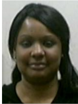
Joi Cooley Day Tech