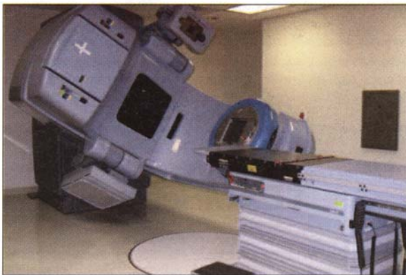
Varian Trilogy System linear accelerator for radiation therapy.